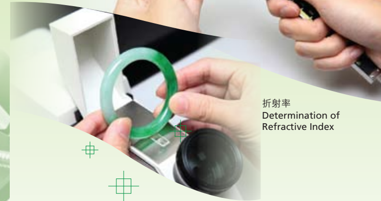
折射率 Determination of Refractive Index

硬玉质翡翠可按测试结果分为四类 Based on test results, Fei Cui (Jadeite Jade) can be classified as belonging to one of the following types: