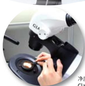
净度分级 Clarity Grading