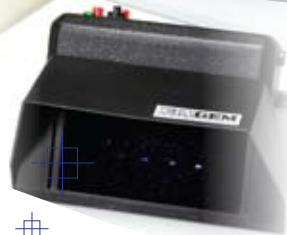
荧光反应 Testing for Fluorescence