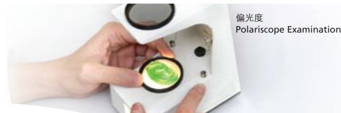
偏光度 Polariscope Examination