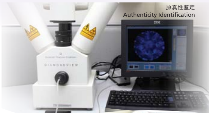
原真性鉴定 Authenticity Identification