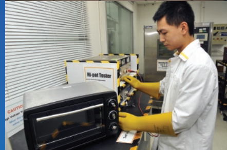
Testing for certification of electrical equipment