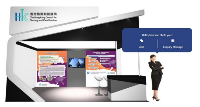
Belt and Road Summit (Virtual Exhibition)