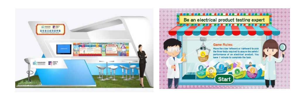
Virtual InnoCarnival 2020