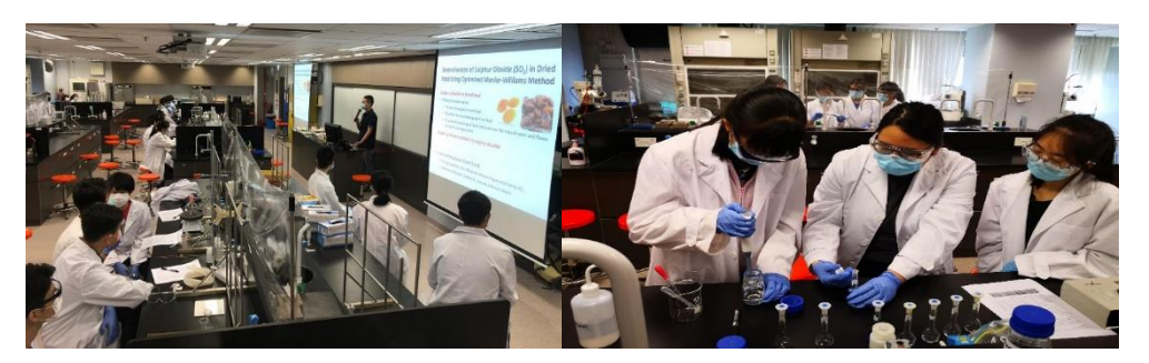
Laboratory Workshops in "Science in the Public Service"