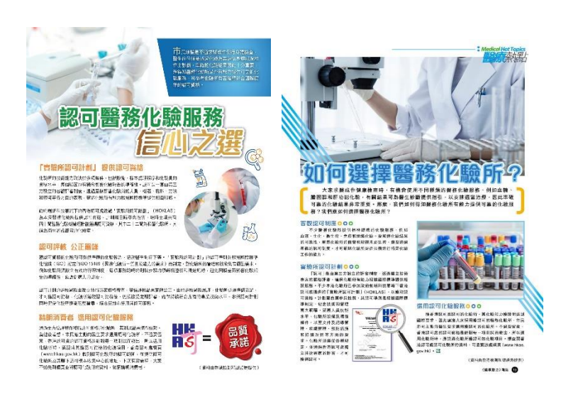
Advertorials in Healthcare Magazines