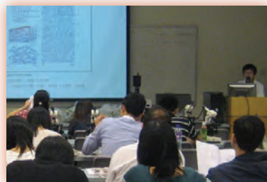
顯微鑑別課程 Microscopic Identification Courses

香港檢測和認證局舉辦的活動 Activities organised by the HKCTC