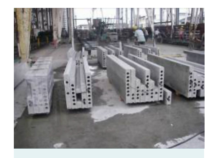
HKHA requires its suppliers to provide panel wall for partitions with product certification.

築獲低過測而進重風及一建影後商認在工試避度新險金旦材響果而證下程的免,訂,錢地出施會言產游實機延和購減的盤現工更,品未地會誤減產少虛工問進更使可能規,工低品時耗程題度為用減通格從程須的間。因而,嚴